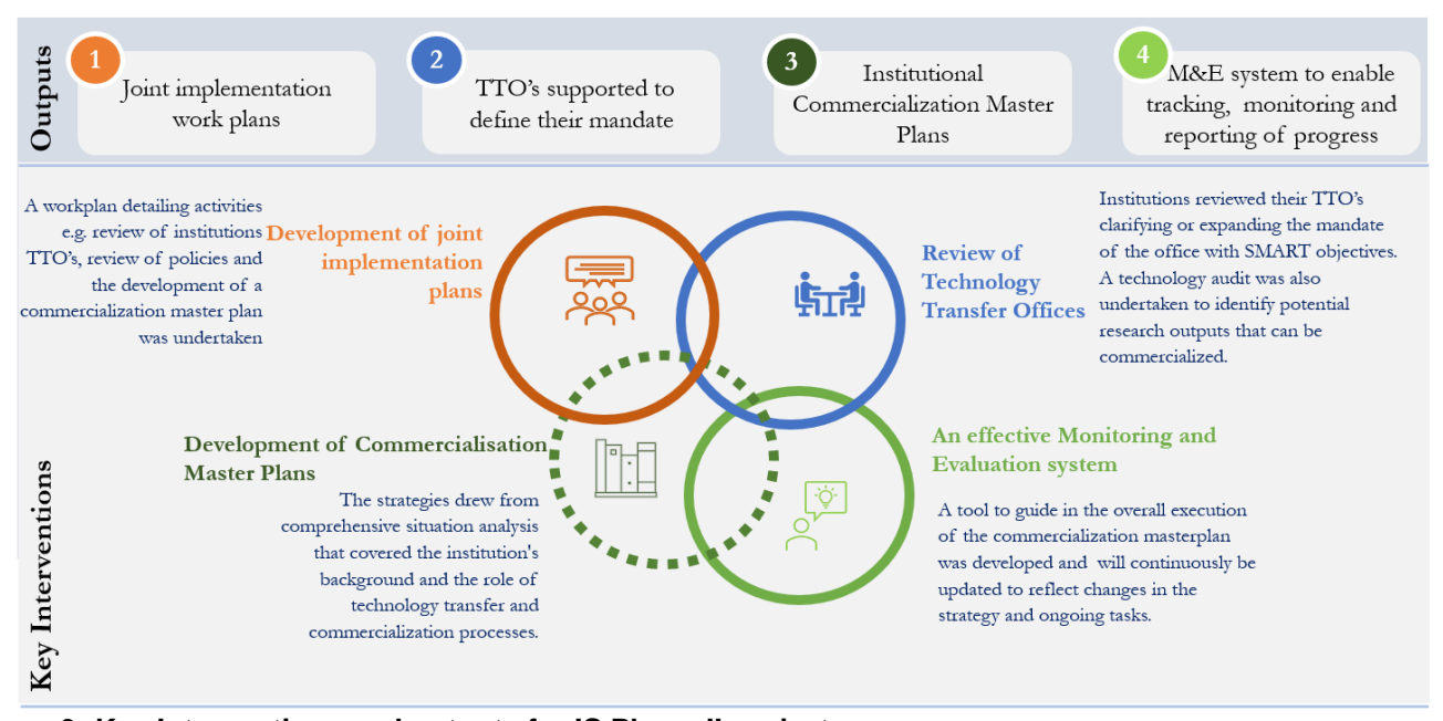
Figure 3: Key Interventions and outputs for IS Phase II project

The project comprised four key interventions and their respective outputs (see Figure 3 below). They included; i) the development of individual institutional implementation workplans, ii) an assessment of their technology transfer office, iii) development of commercialization master pans and iv) a monitoring, evaluation and learning system to monitor progress for the implementation of the master pans. We provide a summary and reflection of the interventions across the five institutions.