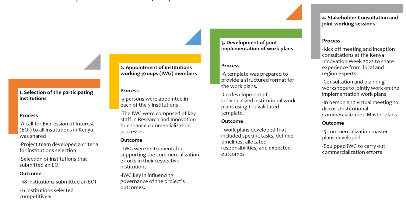
Figure 1: Methodological approach for the project

The methodological approach involved a number of processes outlined in Figure 1. It involved a competitive process where 5 participating institutions were selected among 18 institutions that submitted an Expression of Interest (EOI).